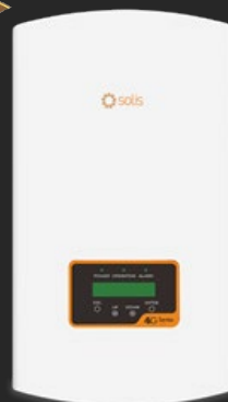
Solis AC inverter / Charger